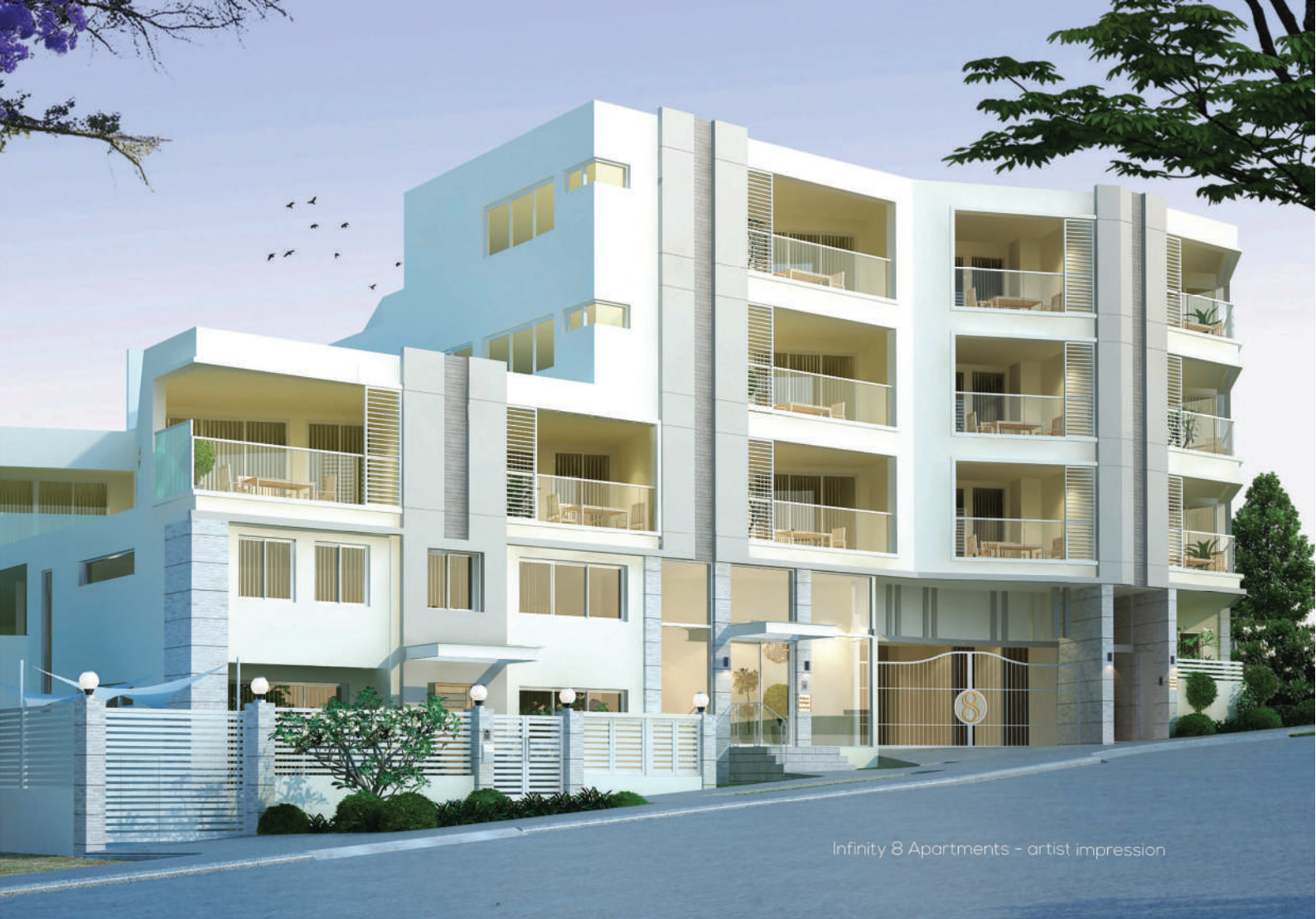
Infinity 8 Apartments - artist impression