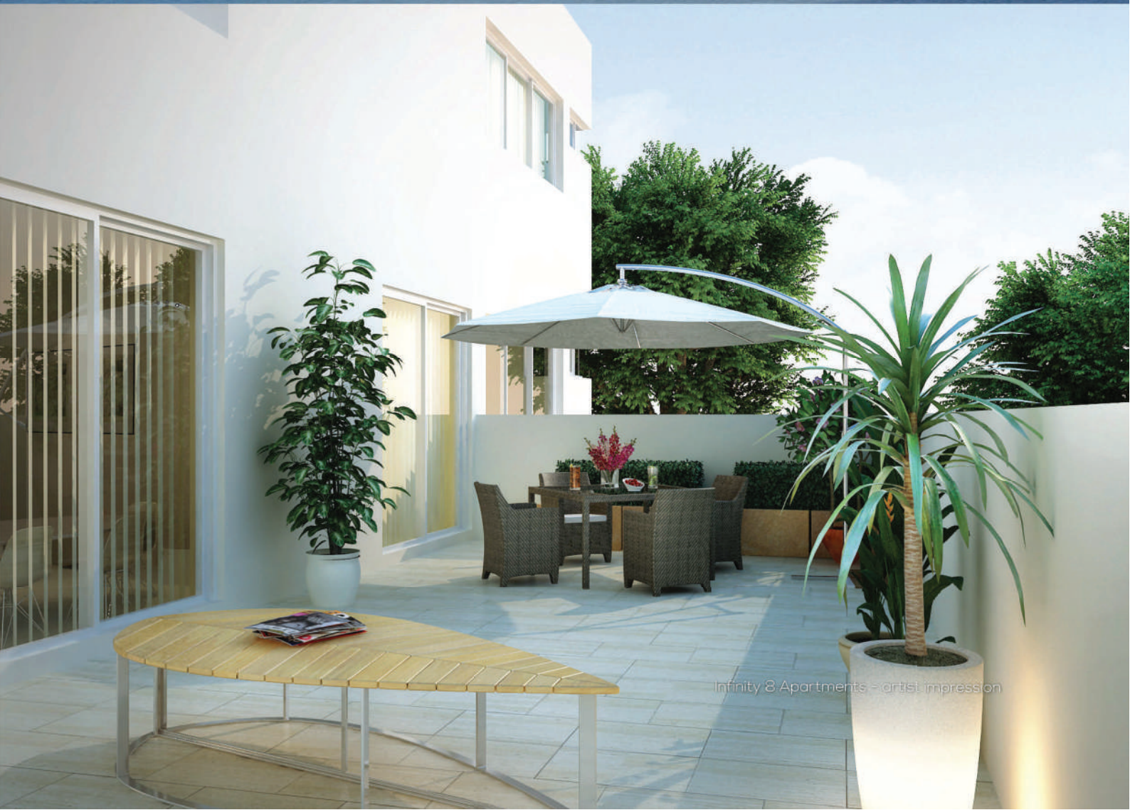
Infinity 8 Apartments - artist impression