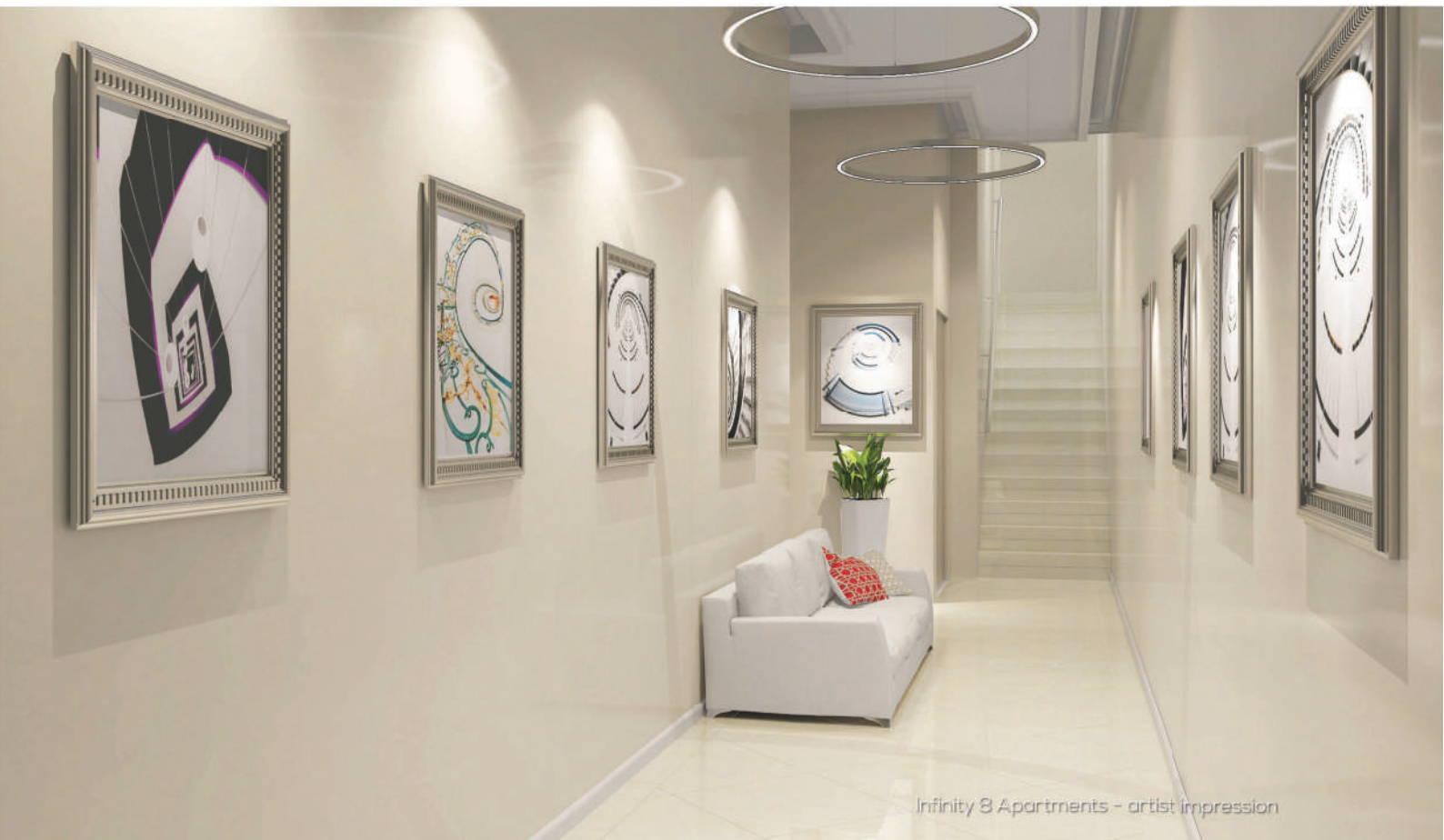
Infinity 8 Apartments - artist impression